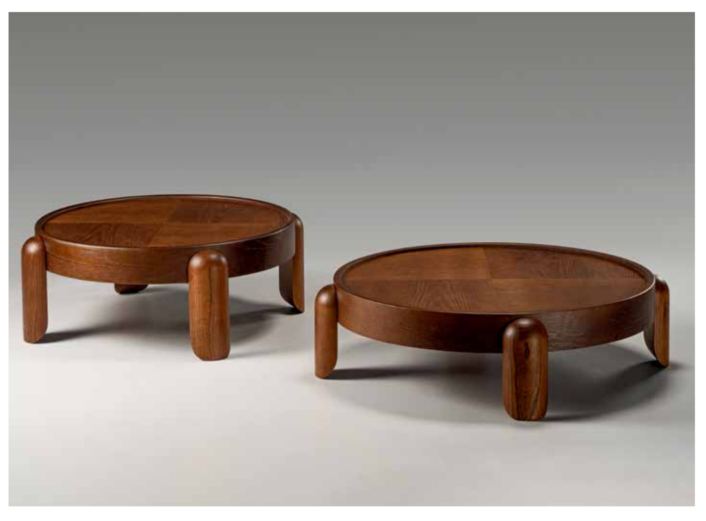
Designed by Eduardo Trevisan, the Nube tables, launched at ABIMAD'39, bring the sturdiness of wood in an elegant design. +msulmoveis.com.br